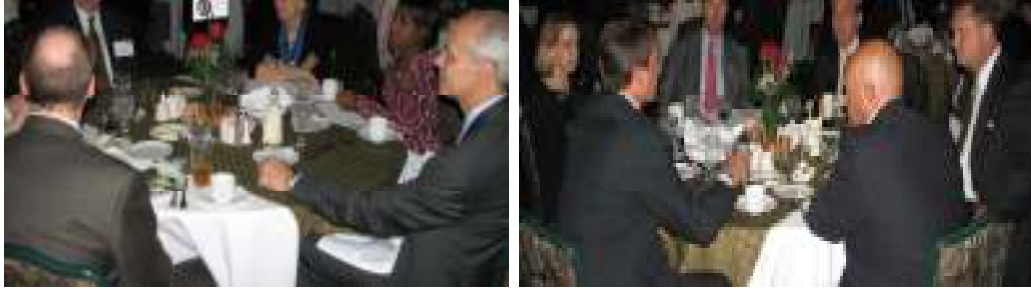
Thursday Evening Anniversary Dinner